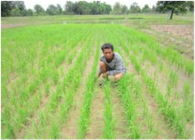
DIRECT SEEDED RICE CROPS IN CHAMPHONE DISTRICT OF SAVANNAKHET IN JUNE 2013 (SOWN ON 6 MAY)