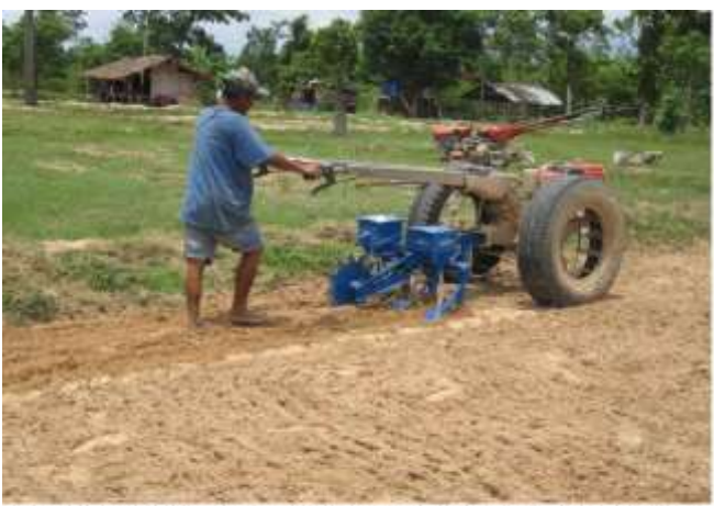
DIRECT SEEDER OPTION FOR FUTURE ON-FARM STUDIES (manufactured in Thailand and being assessed by farmers in Savannakhet province of Lao PDR in 2013 wet-season)