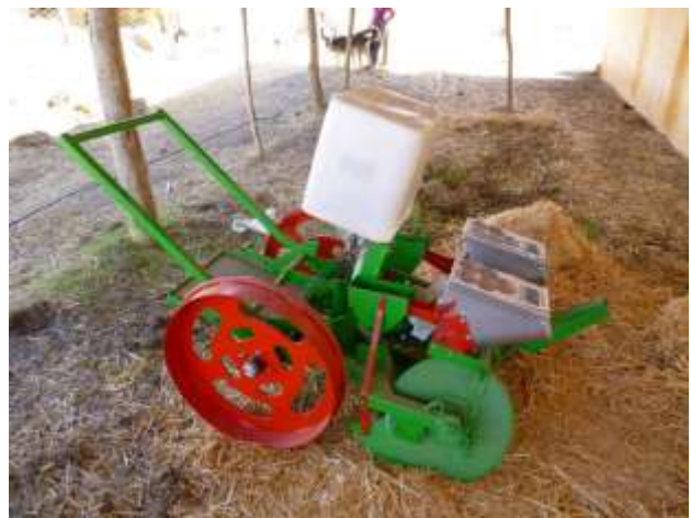
Two row angled single disc for animal traction

pushed need much less weight for penetration, as the downward moment force component of the angled forward movement supplies the downward pressure. (remember your High School studies in Physics?)