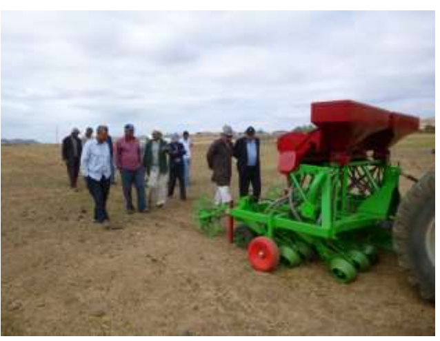
Angled single disc as fitted to seed drill on 4WT Note how the disc units are 'pushed'