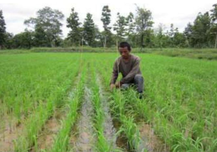
DIRECT SEEDED RICE CROP (PLANTED ON 6 MAY) IN CHAMPHONE DISTRICT - JUNE